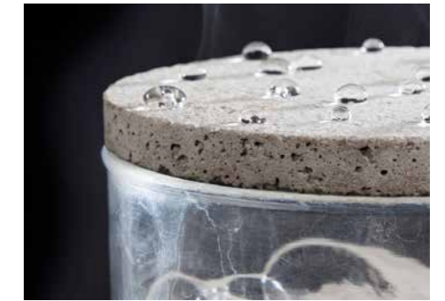
The Effect of LOTOS Multi-effect Waterproof Powder