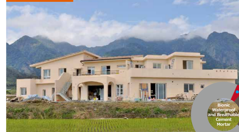
Actual Case Photo

The bionic waterproof and breathable cement mortar, with LOTOS Multi-effect Waterproof Powder added, has waterproof and breathable characteristics and is easy to apply during construction due to its smooth texture. It is suitable for places in which water could easily seep in or has water leakage, such as interior & exterior hydraulic pressure layers, bathroom walls, roof terraces, balcony floors and window frame gaps. Furthermore, it is designed according to the habits of on-site professional engineers, especially applicable in high temperature and humid climate environments. The two main options of the product series are General Usage- Multi-functional Waterproof Powder and the Specialized Mortar Wipe- Multi-functional Waterproof Powder.