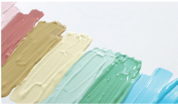
Multiple colors to choose from

"Let Heat Go" is an environmental heat insulation coating that does not contain harmful substances such as heavy metal and fulfills the CRRC and LEED green building evaluation standards. Different from the traditional low heat conductivity materials, with a Solar Reflectance Index (SRI) as high as 105, the product can effectively decrease the heat stress of rooftops and resolve challenges of having an extremely hot indoor environment that feels like the insides of a blistering oven. Additionally, "Let Heat Go" is applied onto cement structures, metal materials, bricks, etc., which could achieve the effect of insulation from the heat outdoors. Moreover, it could be coated on PU, acrylic, polyuria, etc. that could be used as a waterproof protective layer. In addition, "Let Heat Go" has various colors to choose from, so it is not only practical but also aesthetically pleasing.