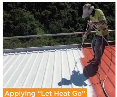
Applying "Let Heat Go"

Reducing electricity usage and achieve the goal of energy saving and carbon reduction.