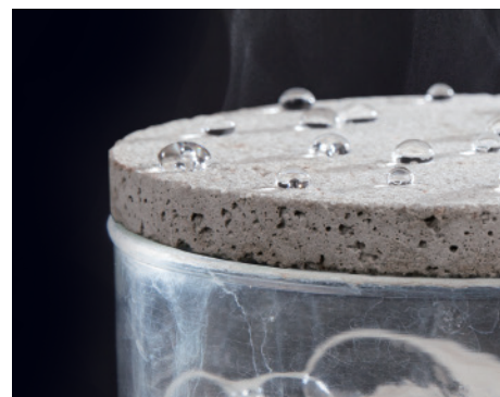
Operational Diagram of LOTOS Multi-effect Waterproof Powder