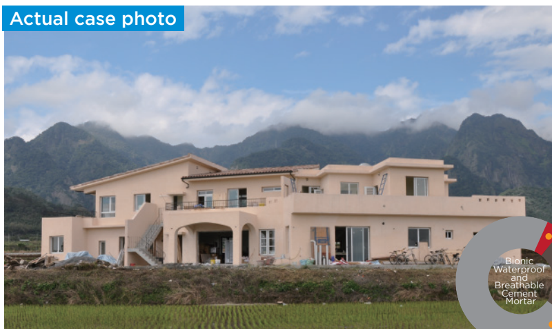
Actual case photo

The bionic waterproof and breathable cement mortar, with LOTOS multi-effect waterproof powder added, has waterproof and breathable characteristics and is easy to apply during construction due to its smooth texture. It is suitable for places in which water could easily seep in or has water leakage, such as interior & exterior hydraulic pressure layers, bathroom walls, roof terraces, balcony floors and window frame gaps. Furthermore, it is designed according to the habits of on-site professional engineers, especially applicable in high temperature and humid climate environments. The two main options of the product series are General Usage- Multi-functional Waterproof Powder and the Specialized Mortar Wipe- Multi-functional Waterproof Powder.